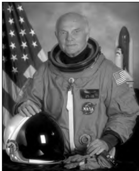
John Glenn was the first American to orbit Earth. He served in the U.S. Senate from 1974–1998.

John Glenn was 77 years old when he left the senate. He was not done serving, though. NASA wanted to find out how space travel affected older people. So they asked Glenn to help. Glenn agreed. In 1998 he flew one final time. He flew around Earth for nine days. He is the oldest person ever to fly in space. John Glenn is a real hero.