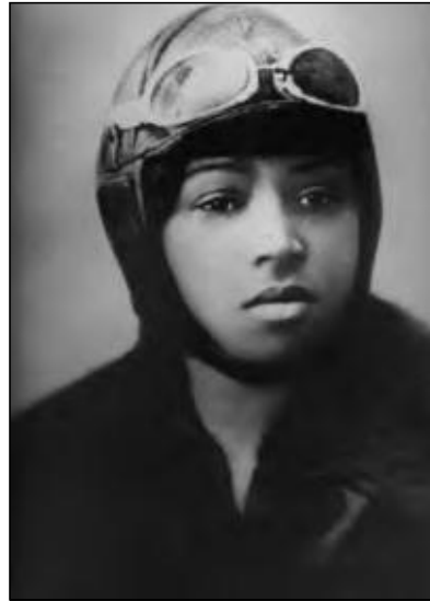
National Aeronautics and Space Administration (NASA)