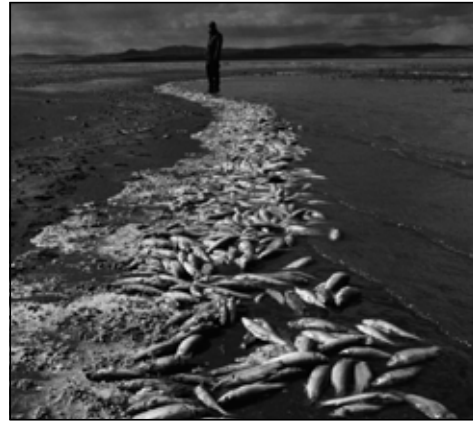
Earth Day's message helped make changes that better protect our environment.

Gaylord Nelson died in 2005, but Earth Day lived on. Every year since 1970, people around the world have gathered on April 22 to celebrate the environment. The message of the demonstrations, however, has changed over the years. Instead of calling for political action, Earth Day protests now focus on what private individuals can do to help the environment. As Gaylord Nelson showed, one person can do quite a lot.