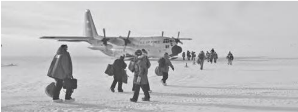
A plane flies team members home from the camp.

107 Scientists work as part of the team to learn more 117 about the Antarctic. Each scientist conducts a different 125 project. Some study the animal and plant life. Some 134 study the climate and weather. Some study the glaciers.