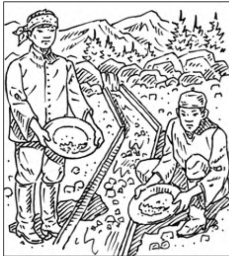
The discovery of gold gave hope to many immigrants.

“I’m just happy we’re together,” Lan said.