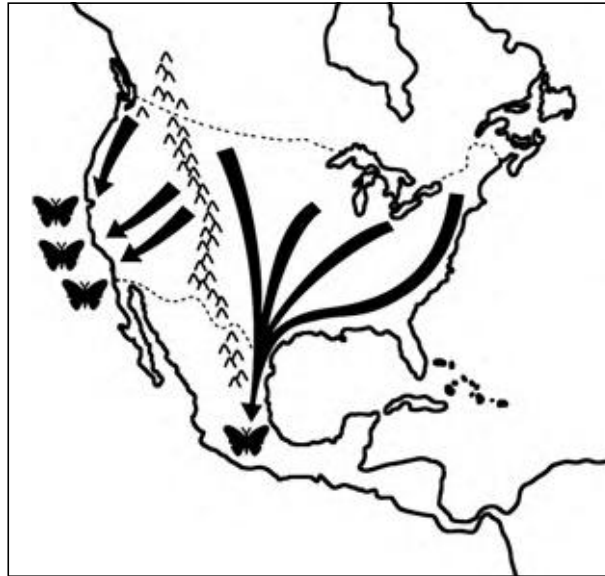
Monarch butterflies west of the Rocky Mountains fly south to California. Those east of the Rocky Mountains fly south to Mexico.

Monarch butterflies live all over the United States. They migrate south each fall to warmer climates. Some fly all the way from Canada to Mexico. Monarchs migrate to adapt to changing temperatures. In the fall, temperatures in the north get cooler, and there are fewer flowers on plants. Monarchs cannot survive very cold winter weather and need flowering plants for food. They move to warm areas in the south where there is food.