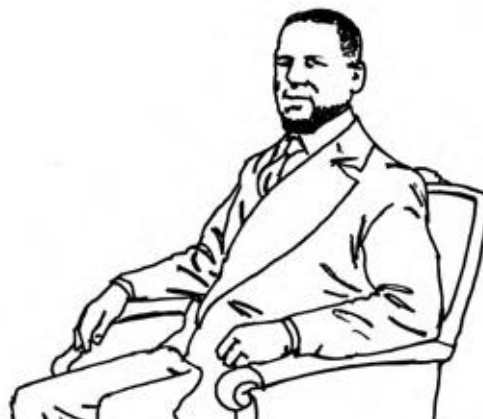
Hiram Rhodes Revels: the first African American to serve in the U.S. Senate.

Hiram Revels helped many people throughout his life. He helped people learn. As a senator, he helped the country progress. He was truly a good citizen!