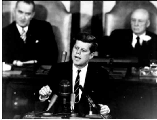
President John F. Kennedy gives a speech to Congress in 1961.

John F. Kennedy did not plan to be a politician. He wanted to have a job in academics or the news. However, from 1947–1953 he was in the House of Representatives. He was a Senator from 1953–1960. In 1960 he was elected president. The words in his speech in 1961 helped bring change. He said, “Ask not what your country can do for you—ask what you can do for your country.” He wanted people to better each other’s lives.